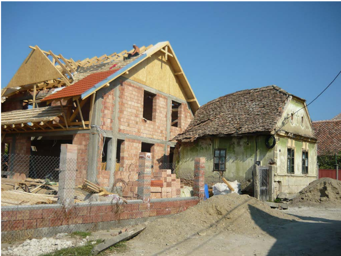
Biertan. House no. 36, Crișan Street, demolished in November 2011, without authorization

Valea Viilor: 1. High humidity at the precinct's wall of the fortified church and at the majority of the buildings in the 3 main streets. 2. Harmful Interventions to the house no. 126 (in front of Mayoralty), to the house no. 438 and to the primary school (by the thermal rehabilitation).