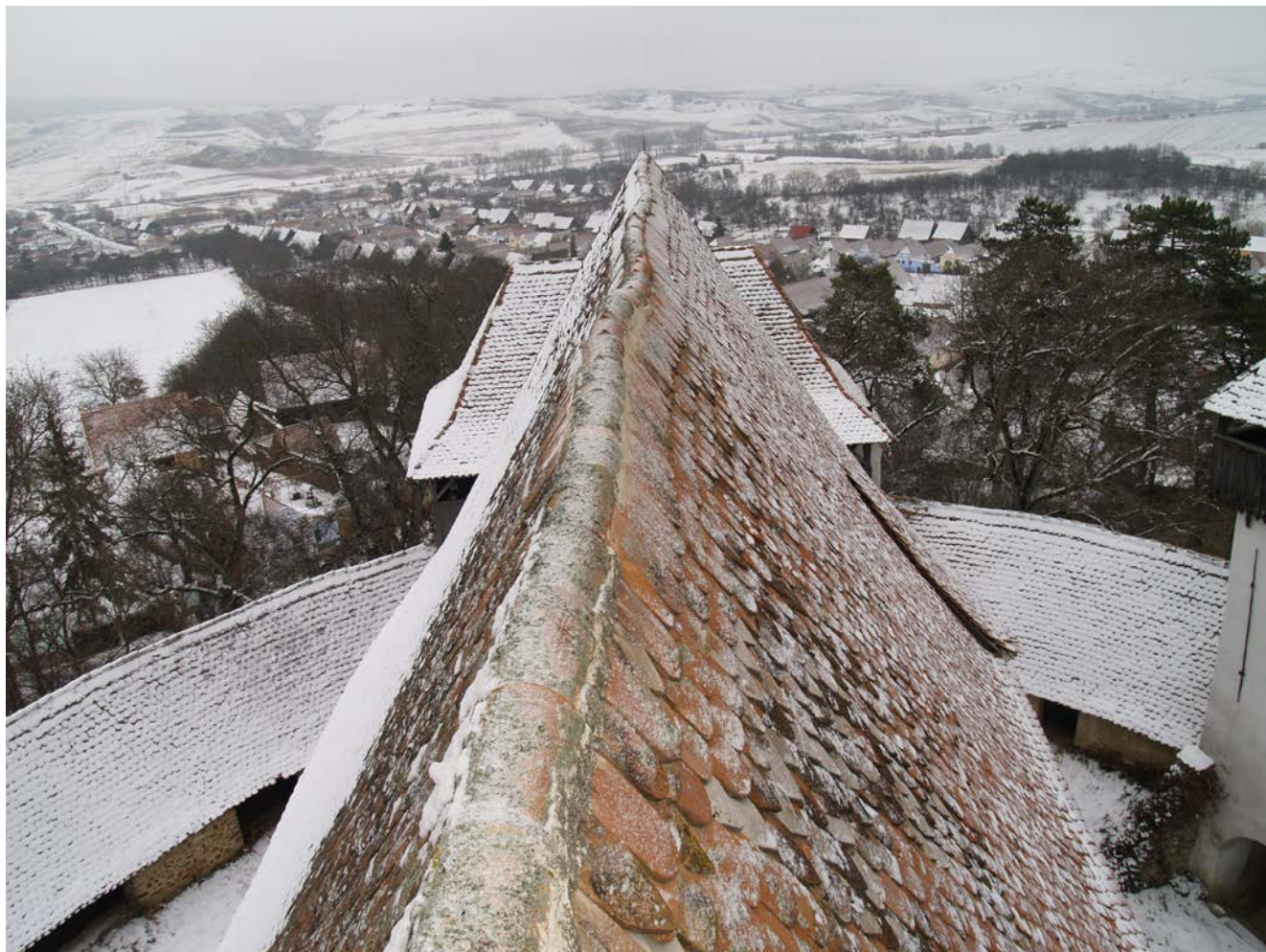
Viscri. East perspective to the village from the bell tower

the criteria (IV), as they were an exceptional example of a type of building, of an architectural or technological ensemble or of a natural one, which illustrates a significant stage in human history. Values and significance of the sites, as they were defined at the time of the inscription and of the extension remained unchanged.