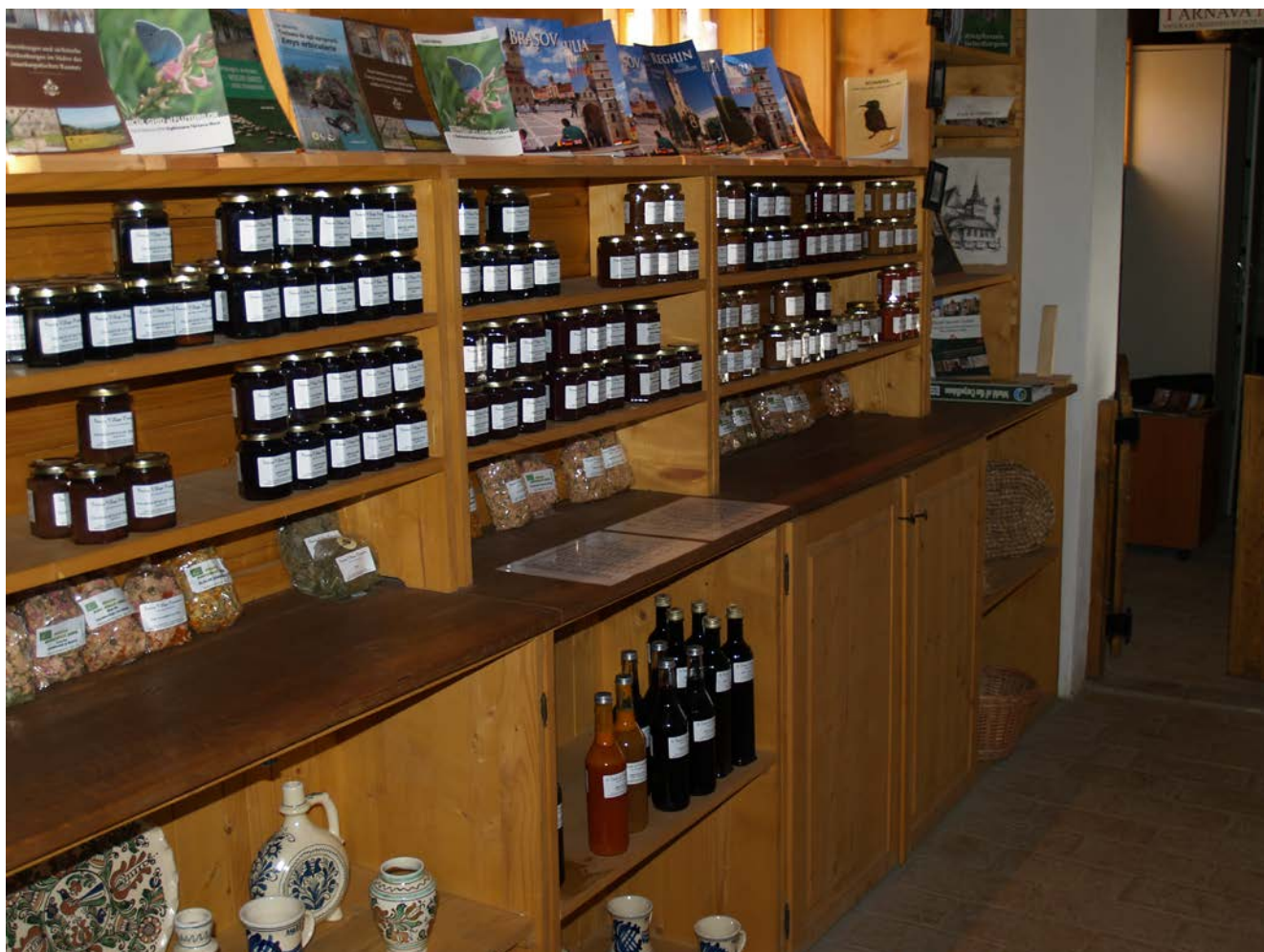
Saschiz. The new opened Tourism Information Centre also offering local traditional products

Saschiz: ADEPT Foundation initiated the recovery of domestic production of fruit jams and syrups (27 varieties). In 2010, one jams and syrups factory opened (Transylvania Food Company). „The jam of Rhubarb” is a registered trademark.