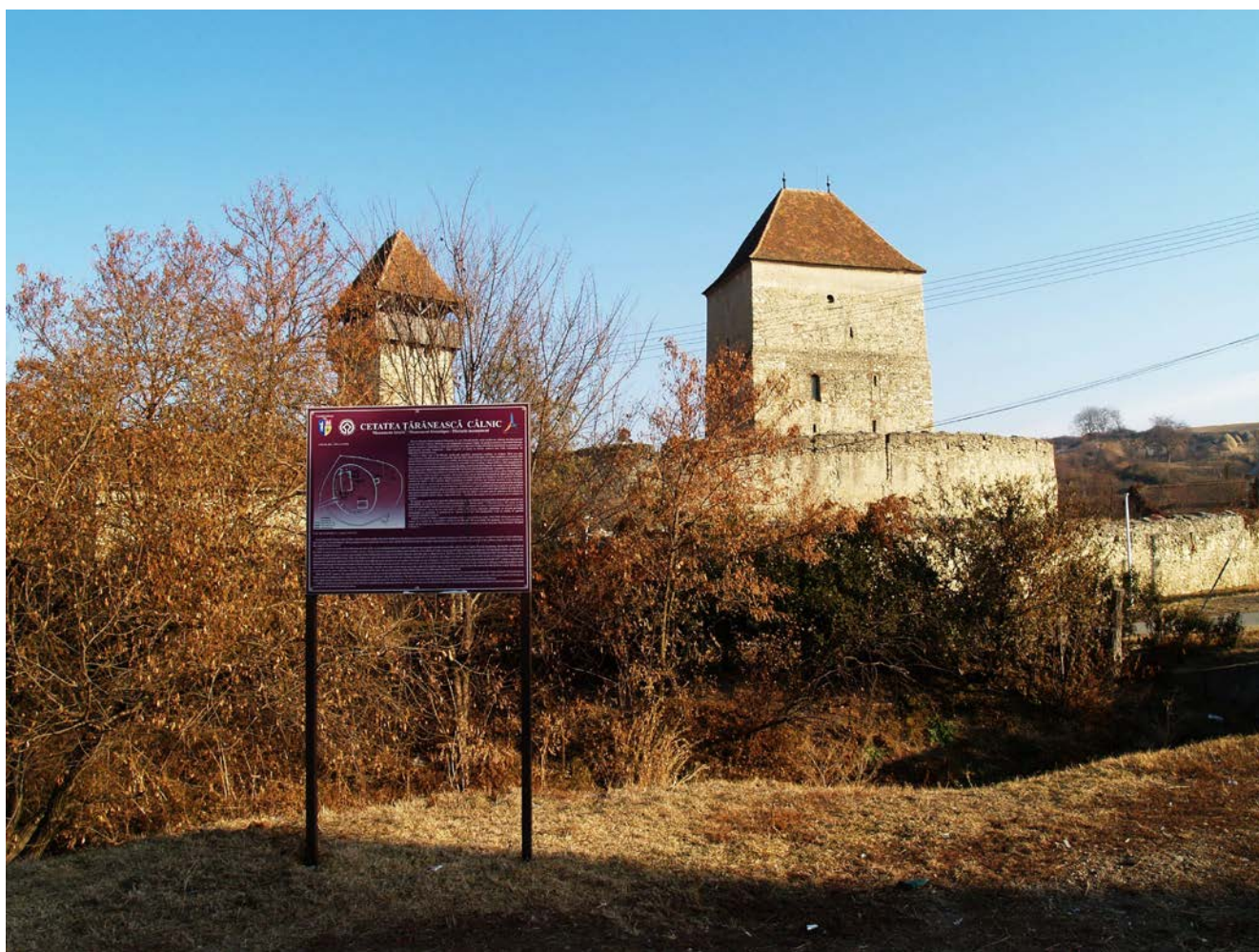
Câlnic. West perspective to the Citadel with a signaling panel

All of the "Villages with fortified churches in Transylvania" are signaled, but not in a unified manner.