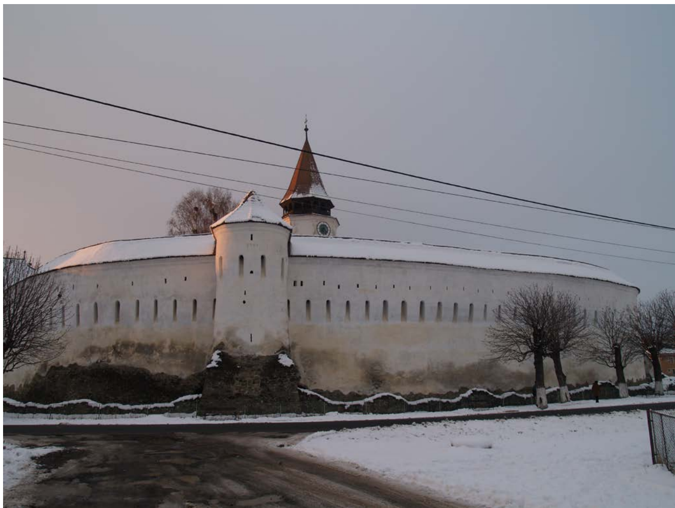
Prejmer. South - East perspective to the fortified church

Valea Viilor: PUZ Protected Area and associated protection area , Phase III, SC „Proiect Alba” SA, Contract nr. 319/2007, Project no. 4823, December 2008. Buffer zone is proposed to be extended.