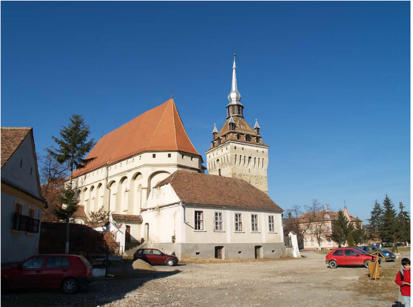
Saschiz. The fortified church restored 2000-2011 and the bell tower put on the National Restoration Plan (PNR)

Câlnic: 1. Updating PUG. Project no. 4709, SC Proiect Alba S.A. In the PUG drawings PUG - there is a difference of the contour of the buffer zone. 2. The mayorality intends to order a PUZ for the central market, following the recent demolition of a parasiting building.