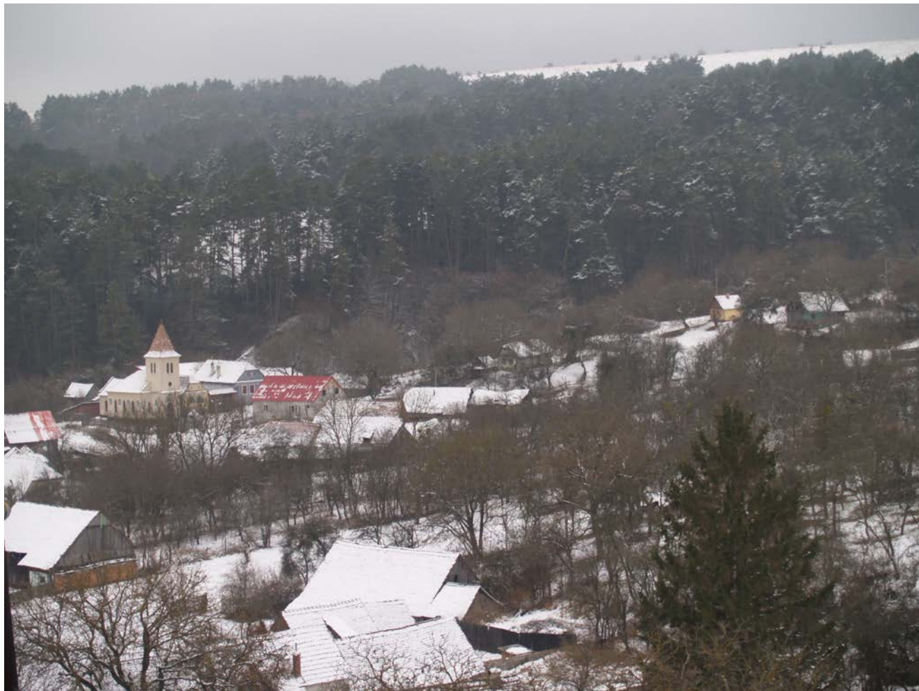
Viscri. The Romanian quarter and the Orthodox Church; new, unauthorised building (with red roof)

Viscri: 1. House no. 10, change of the window gaps size and inadequate. 2. Houses built without authorization: no. 111, near the Orthodox Church, being the end of perspective of the Main Street and a house outside the village, near the treatment plant. The mayoralty reported these cases, in 2010 to the State Construction Inspectorate and to the County Council. 3. Houses in ruins: no. 76, no. 82, no. 84 (MET purchased for rehabilitation), and no. 128 (belonging to a real estate agency).