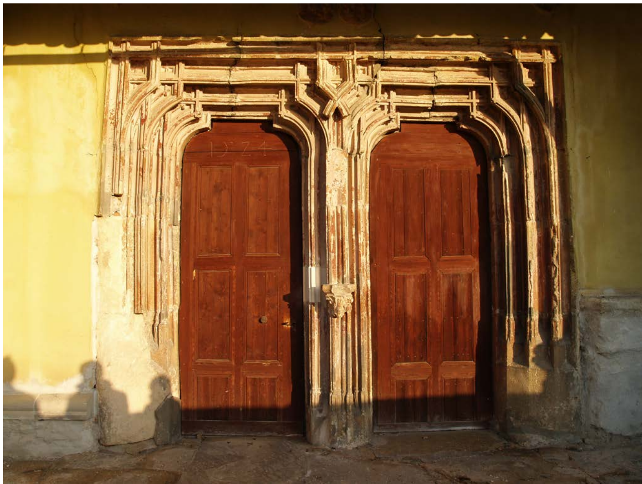
Biertan. West portal (about 1500) - massive loss of lithic material

Biertan: 1. In the Report of DCPN Sibiu 2011 , accompanied by photos - Buildings of architectural and environmental value , seven buildings require emergency interventions. 2. Paintings in bright synthetic colours: houses no. 15, no. 34 and no. 43 Avram Iancu Street; no. 58 Nicolae Balcescu street; no. 9, no. 22 and no. 36 Horea street; no. 2 Tudor Vladimirescu street. 3. At the fortified church, critical condition of the South and West portals - massive loss of lithic material; excess of humidity in the second enclosure wall; inactive cracks on the choir apse (witness fixed in 06/05/1999); high humidity